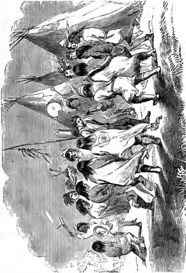
INDIANS TORTURING A PRISONER. — Page 67.